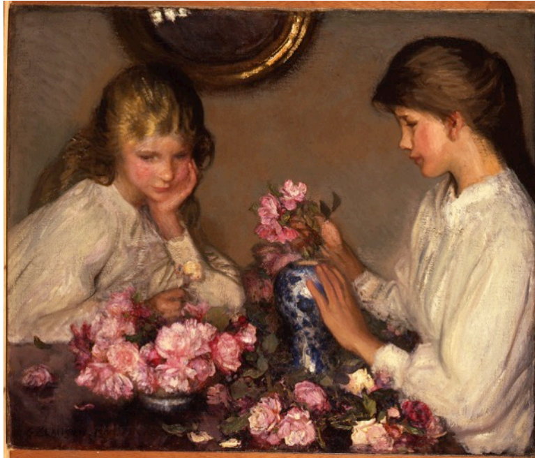
George Clausen, Children and Roses, 1899, oil on canvas

The exhibition Homage to Manet also features several rarely seen works from Norwich Castle Museum & Art Gallery's own collection include, a charming work by Gwen John (1876-1939) of Girl in a Blue Dress holding a Piece of Sewing , dated c.1914-15 and Sir George Clausen's (1853-1944) Children and Roses 1899. Gwen John was one of the few female artists to exhibit at the New English Art Club, while Clausen is credited with enabling Impressionism to gain a wider audience in Britain.